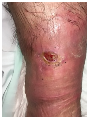
29 weeks after starting BLASTX